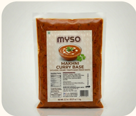
MAKHNI CURRY BASE