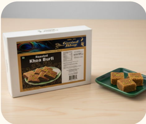
ROASTED KHOA BARFI