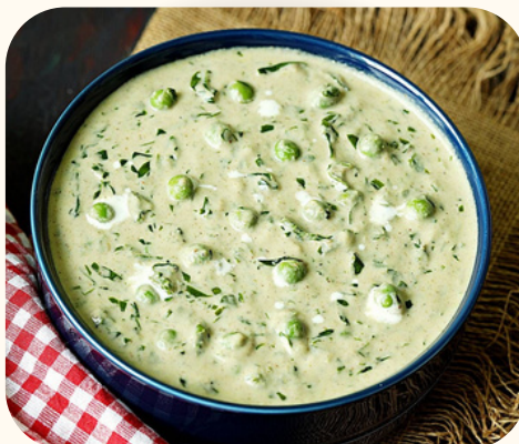
METHI MALAI MATAR