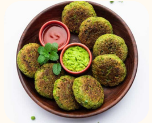
HARA BHARA KEBAB