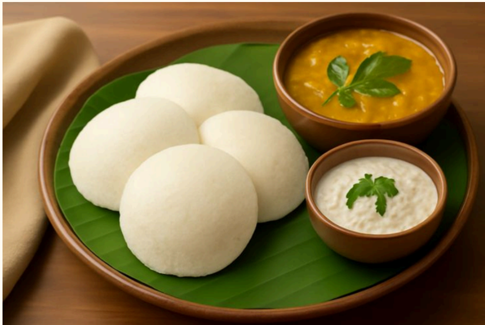
IDLI WITH CHUTNEY - 12 PC & 24 PCS PACK