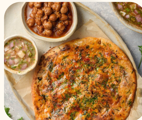
AMRITSARI CHOLE KULCHE