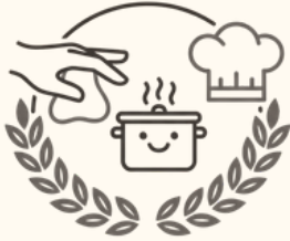
Easy to Shape & Cook