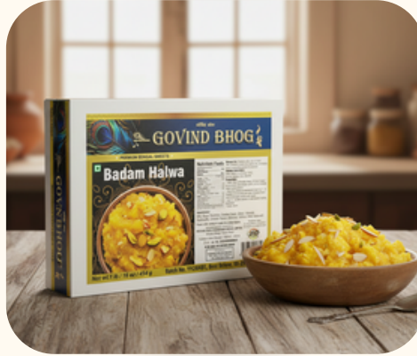
BADAM KESAR HALWA