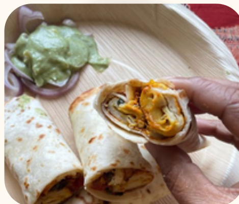
SOYA CHAAP KATHI ROLL