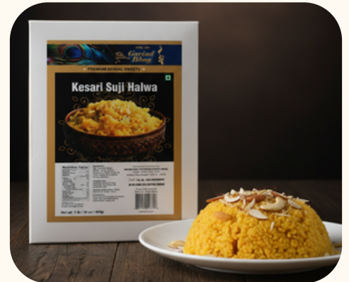
KESAR SUJI HALWA