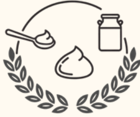
Rich & Creamy Texture