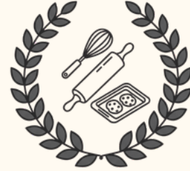
Ideal for Cooking & Baking