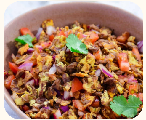
CHANA JOR GARAM