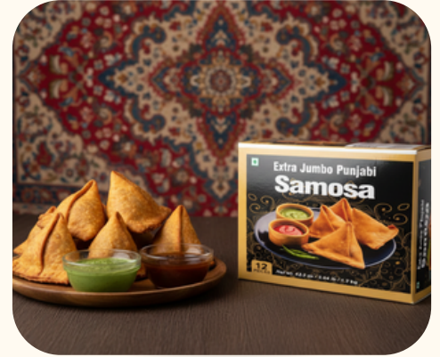
EXTRA JUMBO PUNJABI SAMOSA