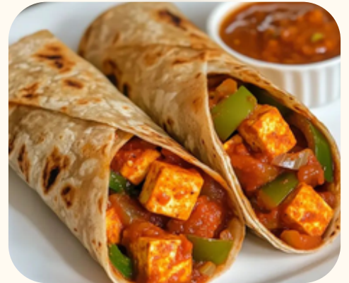
MASALA PANEER KATHI ROLL