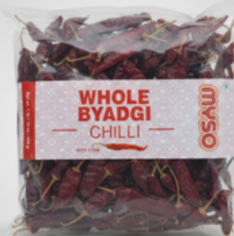
WHOLE BYADGI CHILLI