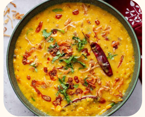
YELLOW DAL TADKA