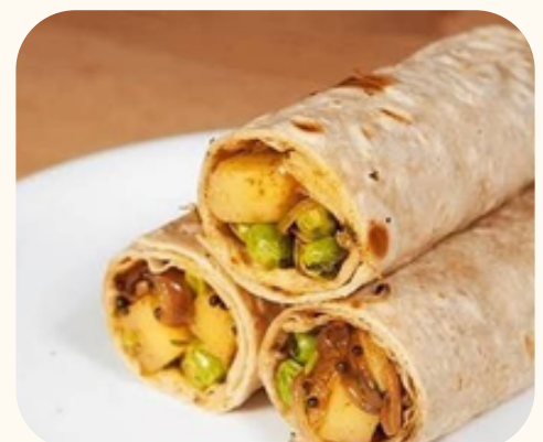
ALOO MATAR KATHI ROLL