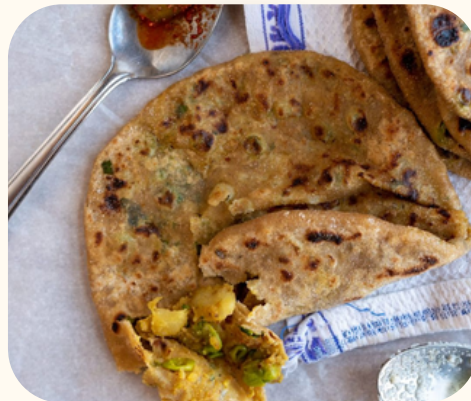
ALOO MATAR PARATHA