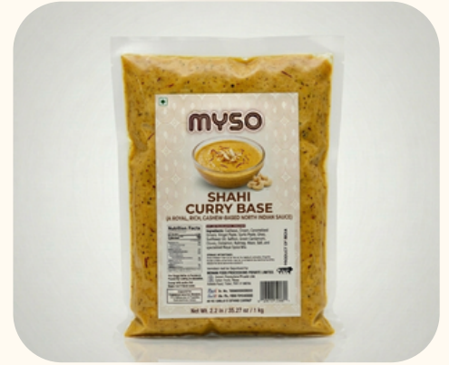
SHAHI CURRY BASE