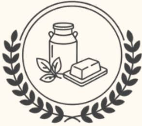
Pure Dairy Butter