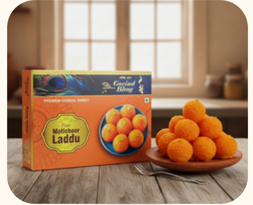
MOTI CHOOR LADDU