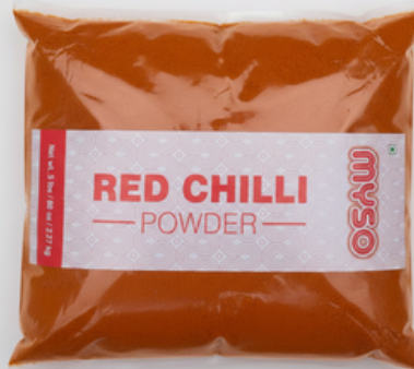
RED CHILLI POWDER