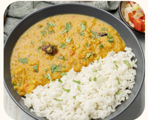
YELLOW DAL CHAWAL