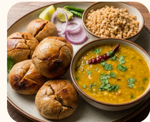
DAL BAATI CHURMA