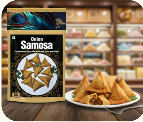
IRANI ONION SAMOSA