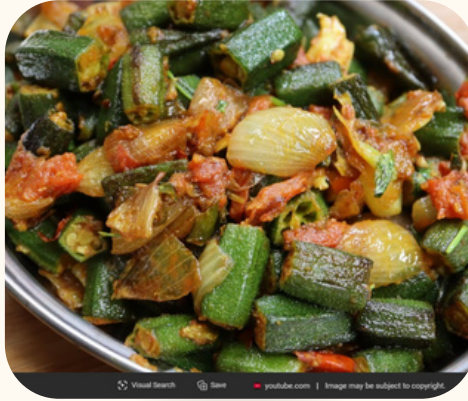
ONION BHINDI SABJI