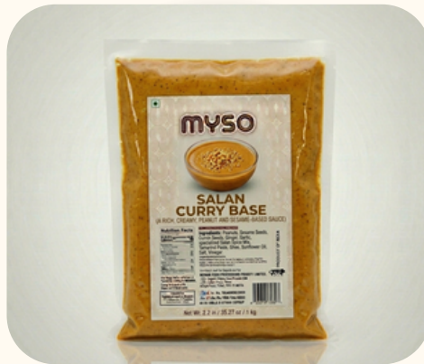
SALAN CURRY BASE