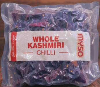
WHOLE KASHMIRI CHILLI