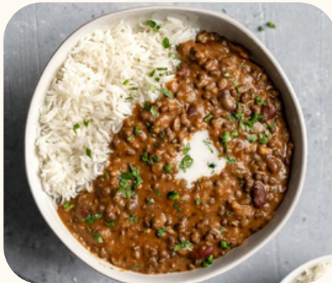
DAL MAKHNI CHAWAL