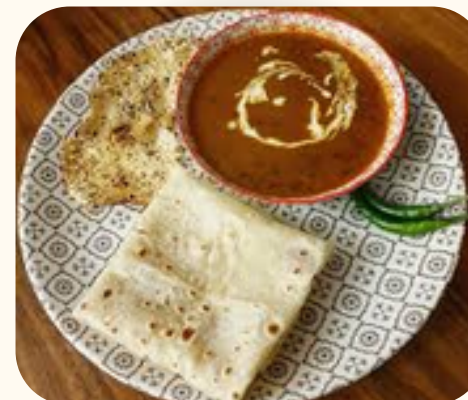
ROOMALI ROTI & DAL MAKHNI