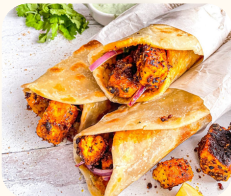
PANEER TIKKA KATHI ROLL