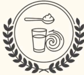
Rich & Creamy Taste