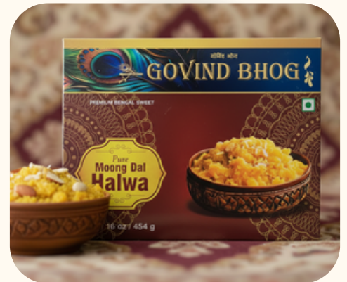
MOONG DAL HALWA