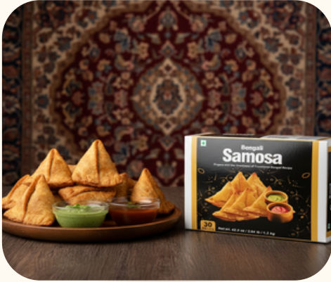
REGULAR JUMBO SAMOSA