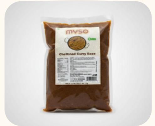
CHETTINAD CURRY BASE