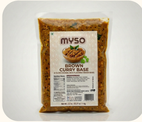
BROWN CURRY BASE