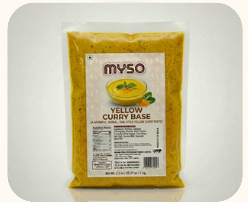
YELLOW CURRY BASE