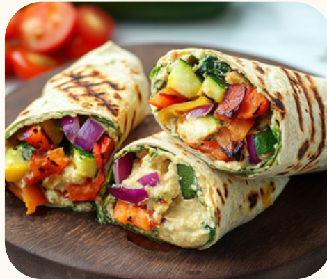
MIX VEGETABLE KATHI ROLL