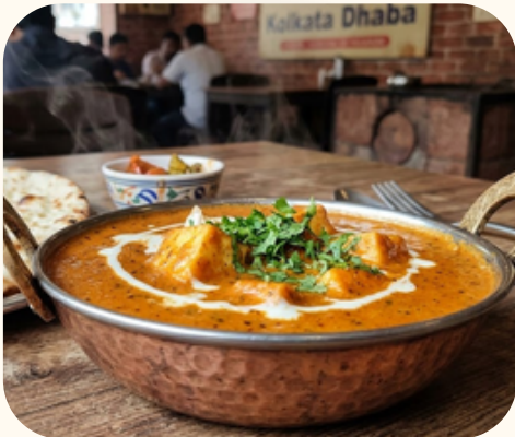
PANEER BUTTER MASALA