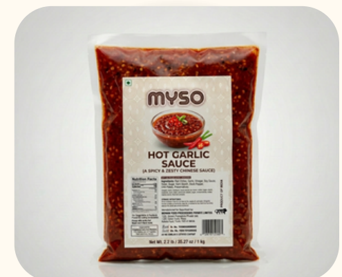
HOT GARLIC SAUCE